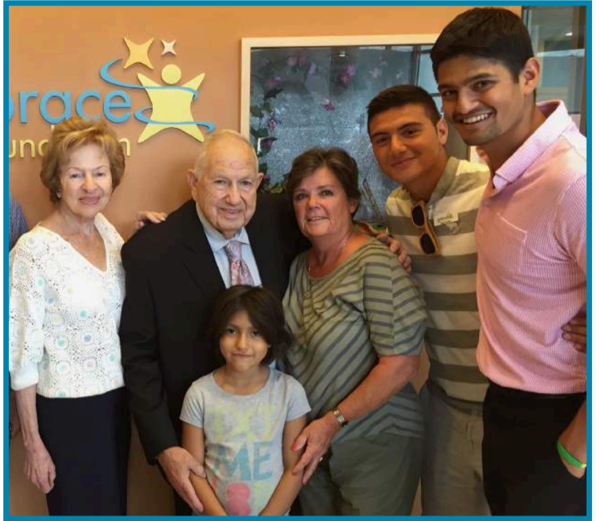
The Edith and Martin Stein Building of Hope in New Brunswick, NJ